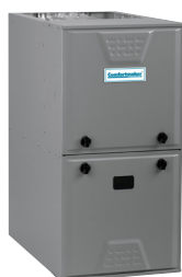
Ion Series Gas Furnaces